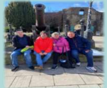
Ludlow Market & Walk