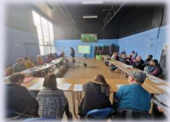
Members of the Network at a meeting at Youth House