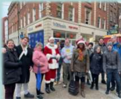
Worcester Victorian Market