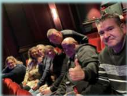
Malvern Theatre Pantomime