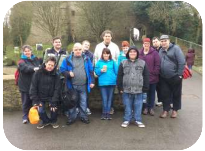
Trip to Dudley Zoo