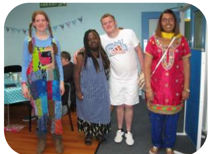
Musical Theme Night