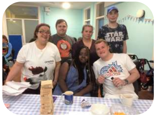
Members of Kidderminster based groups getting together and socialising