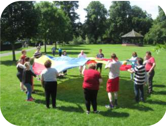
Sports and Picnic in Stourport