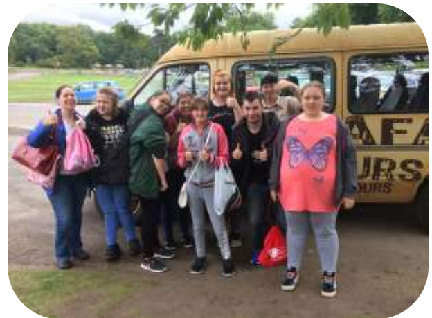
Trip to West Midlands Safari Park

This group meets on a Monday. The group has undergone a transformation as many of the old members, who became too old for the group and moved on to other groups, were replaced by lots of new members.