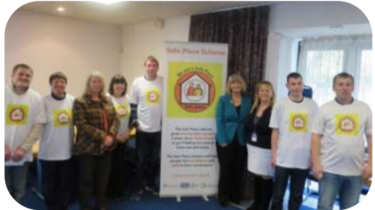
Pershore Safe Place Launch

People can find their nearest Safe Place by looking on the Safe Place directory on our website www.ourway.org.uk or by using the 'My Town' app which can be downloaded to smart phones or tablets.