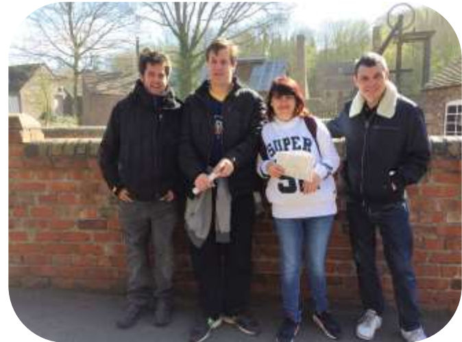
Trip to Ironbridge Museum