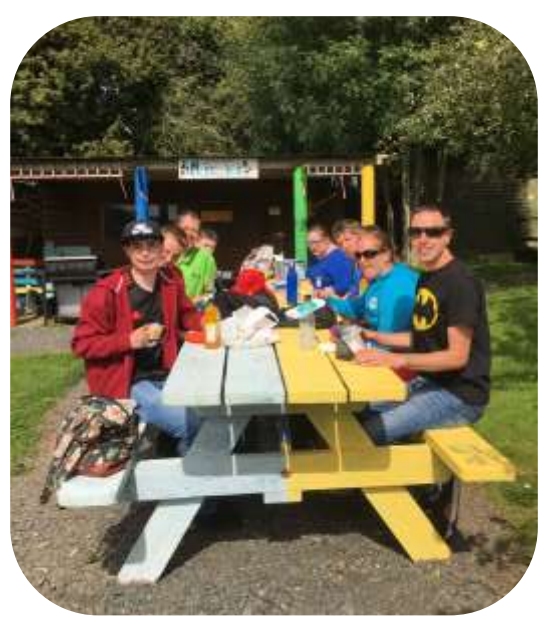
Ninevah Ridge Care Farm

During the holidays they enjoyed trips to Drayton Manor, Nineveh Ridge Care Farm and a visit to The Old Vicarage to play Laser Tag.