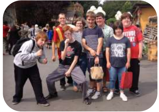
Safari Park Visit