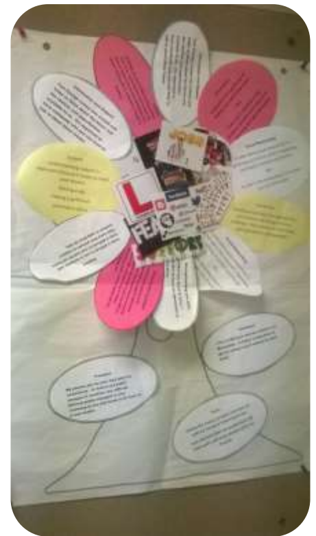
Young Consulters' Consulting Tree

from across Worcestershire. The Young Consulters now attend and contribute to the Worcestershire Transition Sub Group and Worcestershire Transitions Steering Group.