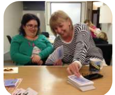
Self Advocacy Group Activities