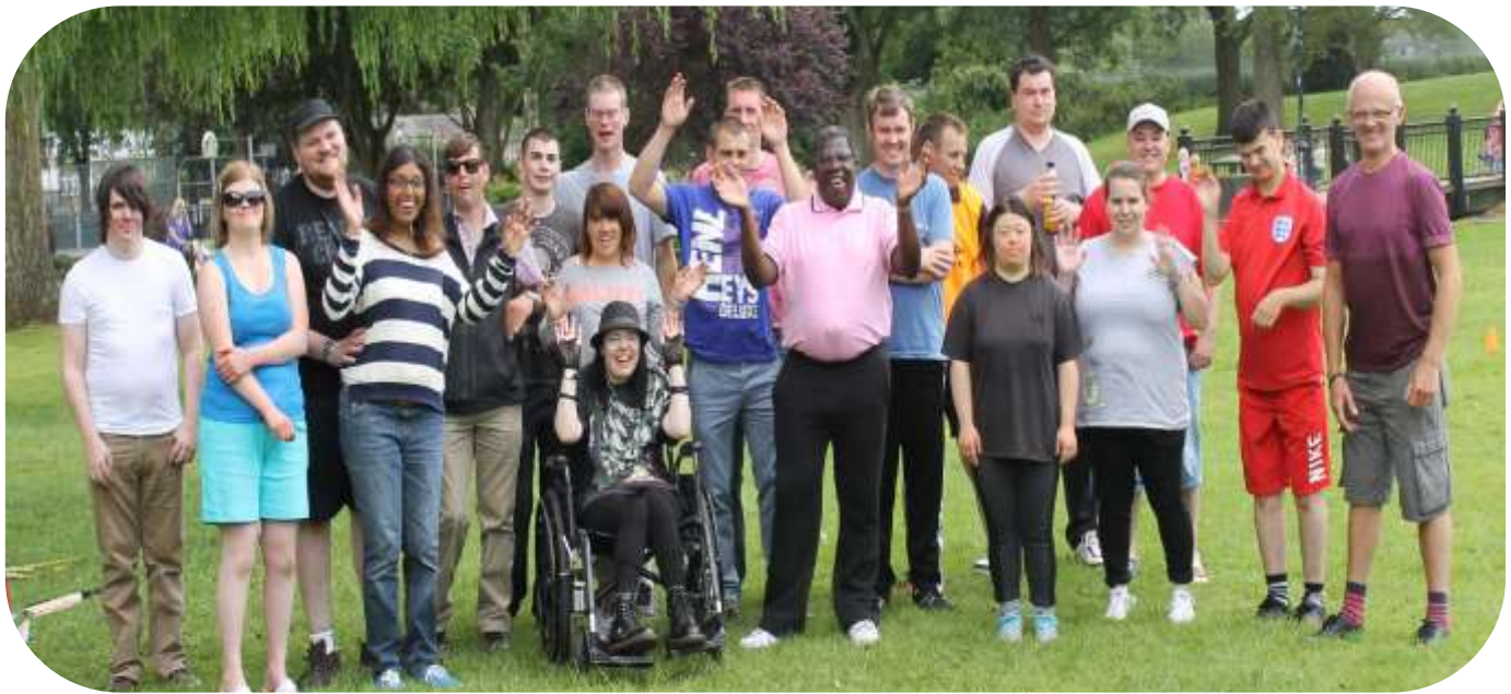
Sports Day - Sanders Park, Bromsgrove