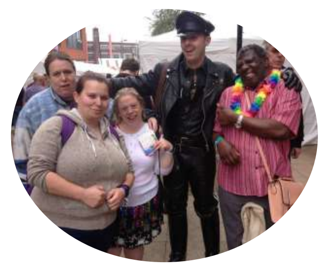
Gay Pride 2015