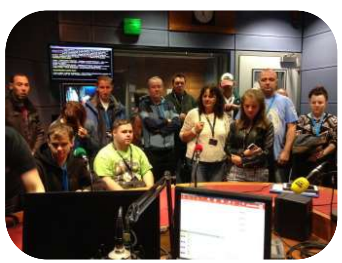
BBC Mailbox Tour