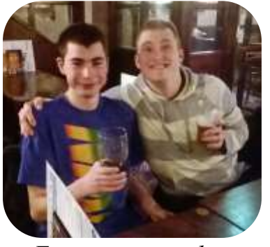
Enjoying a meal out (Members of Freedom Fighters)