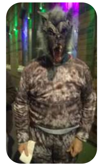
Halloween Zombie Theme Night