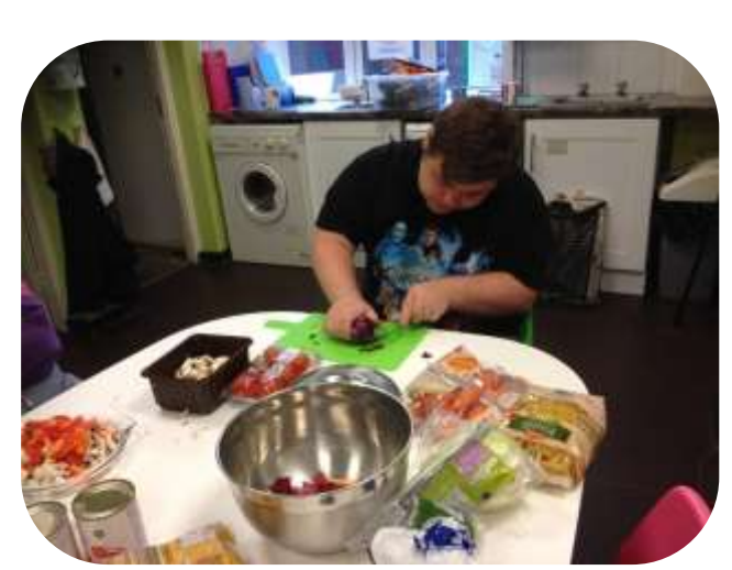
Come Dine With Me