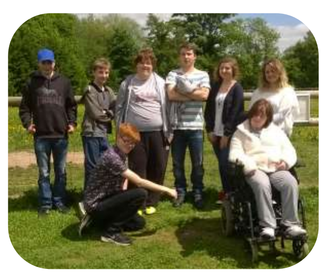
Visit to Cob House Farm (Members of Friends United)

Young People's Group (Funded by Children in Need) Young self advocates use these meetings to share their news and ideas with friends. This year they have had lots of fun planning and taking part in many different activities and projects.