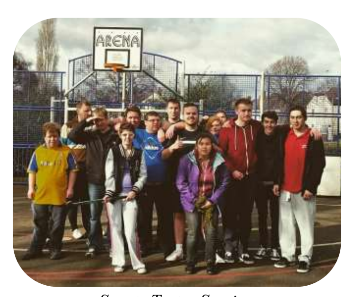
Sports Taster Session